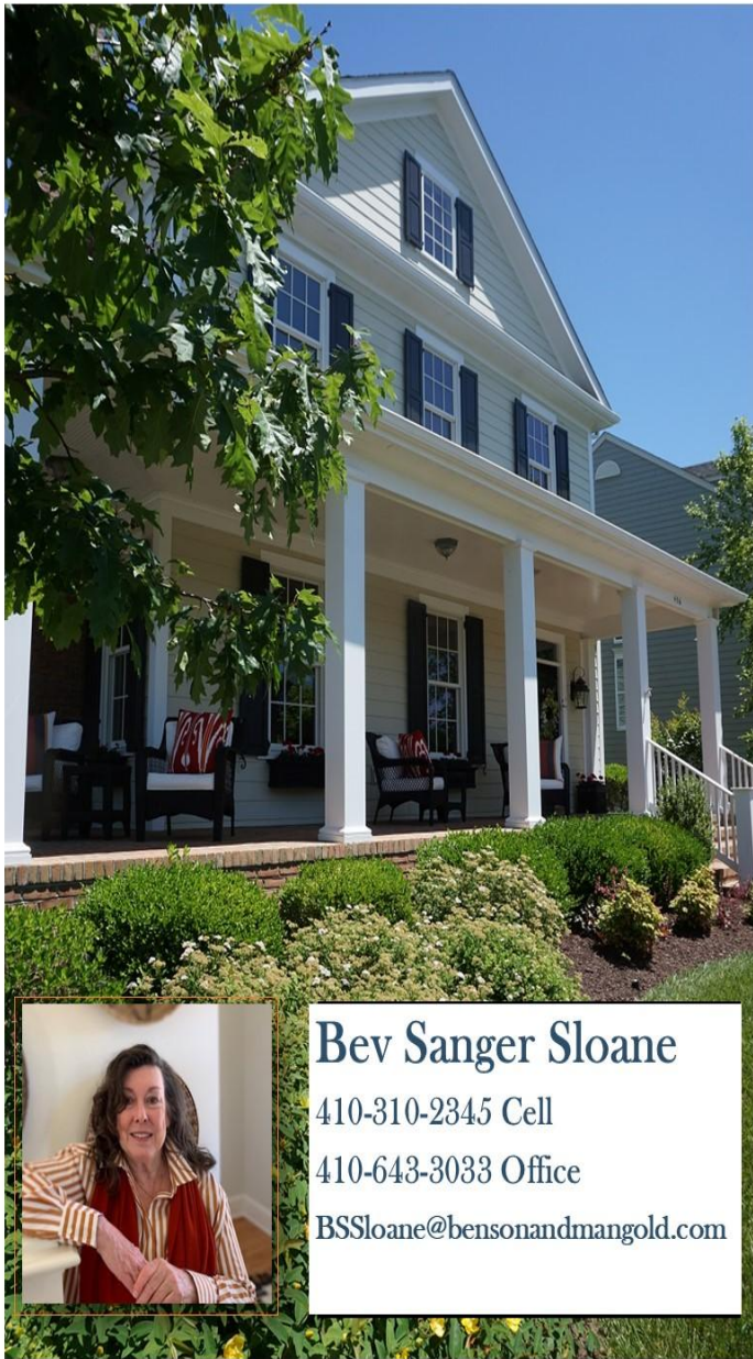
Bev Sanger Sloane