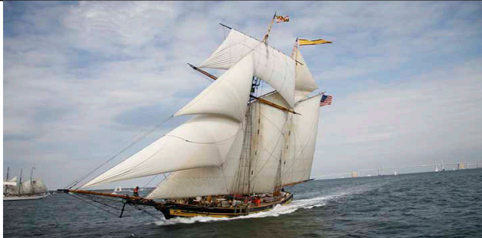
Tall Ships 2012

AS A SELLER, THERE IS REALLY ONLY ONE SIGN YOU WANT TO SEE IN FRONT OF YOUR PROPERTY