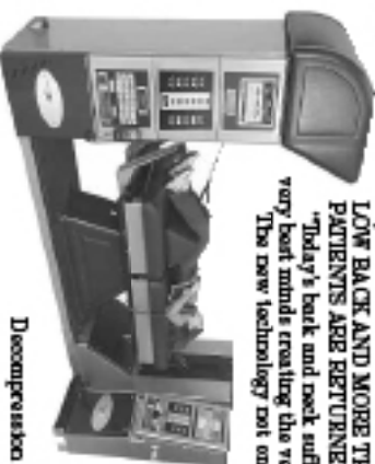
Decompression is so gentle most of

"Today's back and neck sufferers have the benefit of the very best minds creating the very best technology." The new technology not only repairs and restores discs to their original function, but does it without pain and down time for the patient. "The DRX9000C creates a negative disc pressure within the pathological discs and allows the herniated material to go back into place.